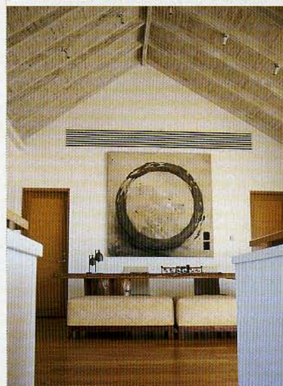
↙ From top: A spa pagoda at Ten Thousand Waves; the Como Shambhala spa; opposite, very happy hour at Parrot Cay's Beach Bar.