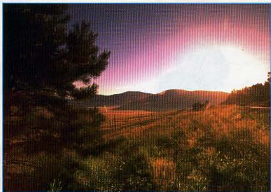
TAKE IN THE PINK MOUNTAIN SKY—AND SHOP TILL YOU DROP AT SANTA FE'S INDIAN MARKET

recommendations. If you only dine twice in Santa Fe, make sure it's at the Compound (653 Canyon Rd, 505-982-4353) and gay-owned Geronimo (724 Canyon Rd, 505-982-1500, geronimorestaurant.com ), recipients of consistent accolades for their adventurous Southwestern fare and friendly atmosphere. Both are housed in historic adobe homesteads on gallery-lined Canyon Road. Other local favorites are